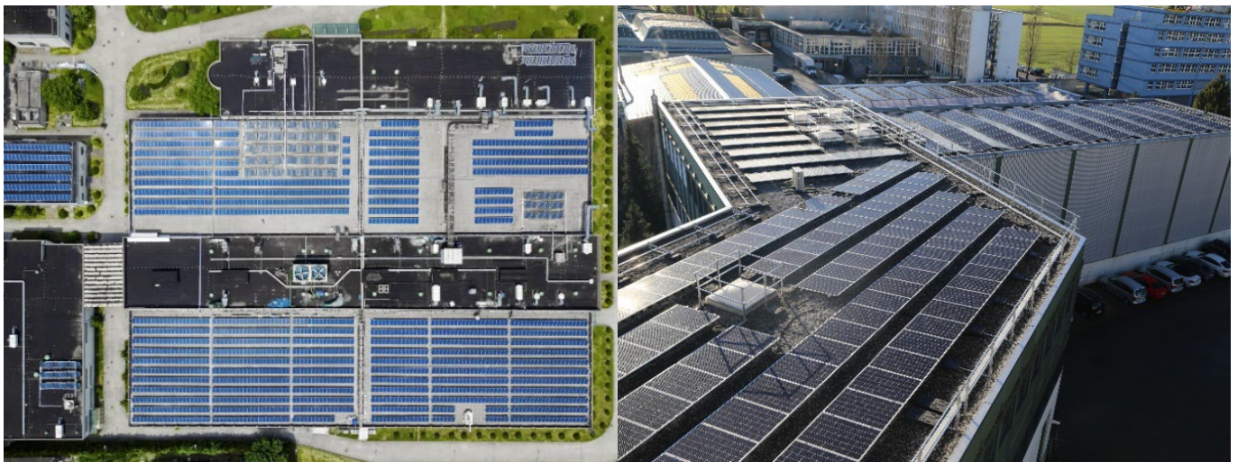
(a) Various in scale roof-mounted PV panels (left: large data centre; right: mixed use workshop/warehouse/offices at Securiton HQ)

Obviously, flat mount PV panels can be installed on a pitched roof or vice versa (see Figure 1 (c)).