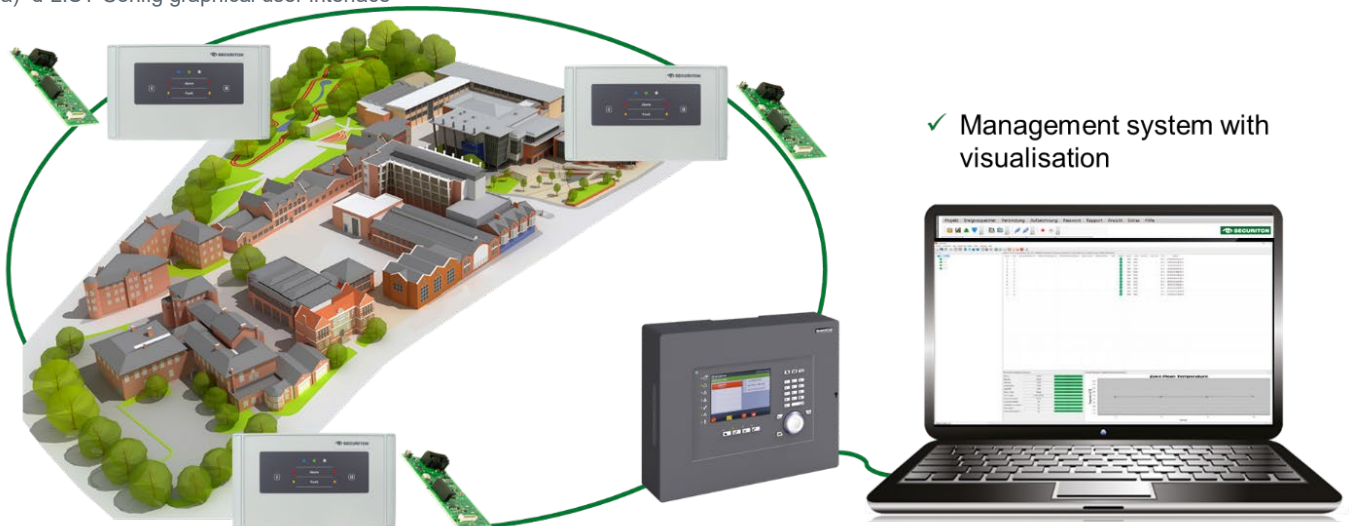
(b) d-LIST controllers networked via redundant loop to a SecuriFire FAS Figure 3 System integration considerations for SecuriHeat d-LIST