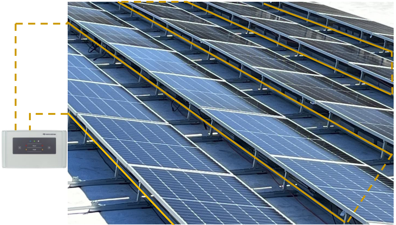
(a) d-LIST sensing cables layout monitoring pitched Roof-Mounted PV Systems