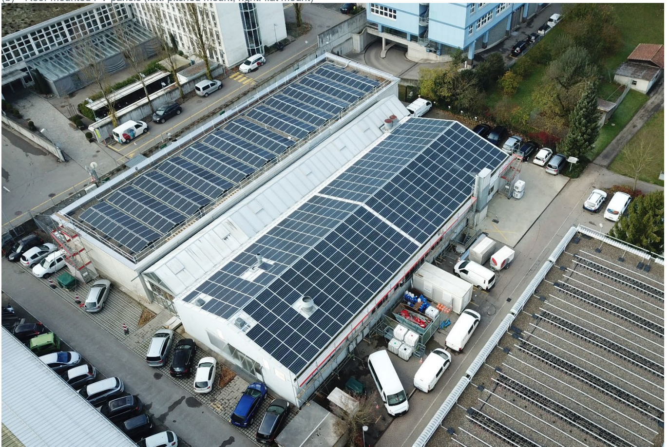
(c) Pitched panels on a flat roof and flat panels on a pitched roof, Securiton HQ in Zollikofen.