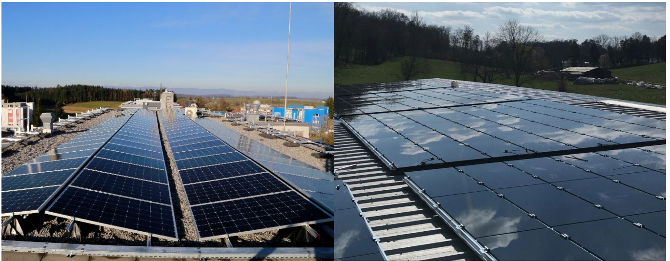
(b) Roof-mounted PV panels (left: pitched mount; right: flat mount)